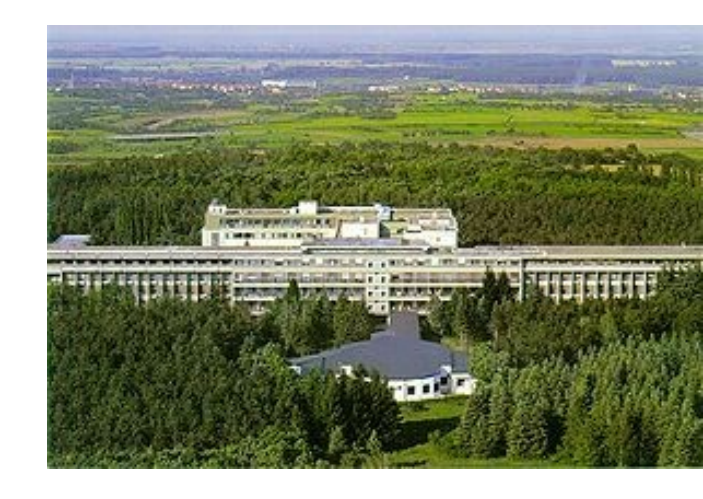
Institute of Oncology Sremska Kamenica