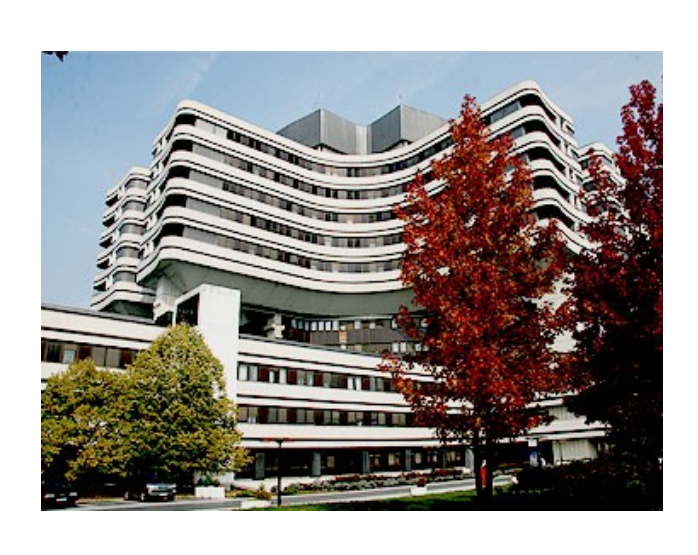
Military Medical Academy, Belgrade

~ 1990. two radiotherapy departments established a connection that could be called a telemedicine.